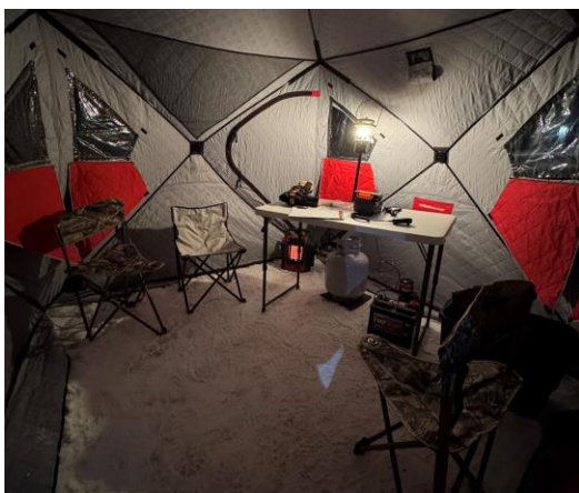
The inside of N9MDE's comfortable tent.