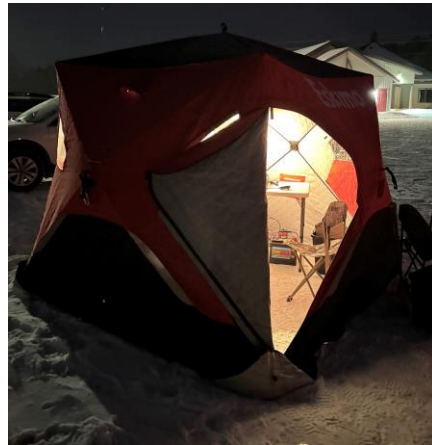
The outside of N9MDE's tent set up Prince of Peace Lutheran Church on M-28 in Harvey.