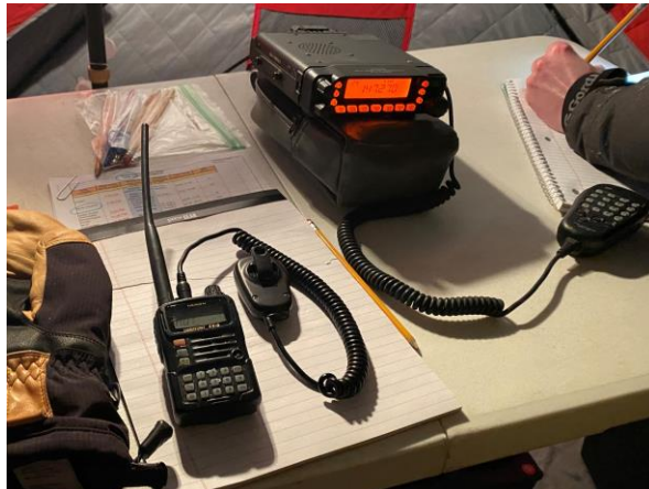
A close-up of their Ham Radio gear.