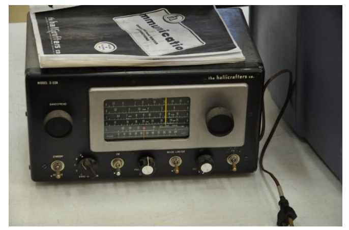
Swap and Shop 2014