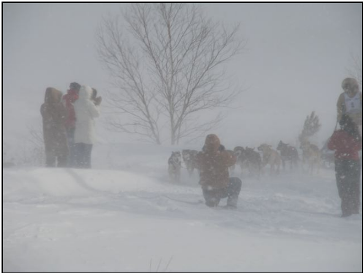
Spectators and the conditions at the welcome center