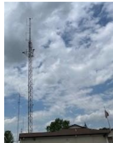
Some of DARA's impressive antennas.