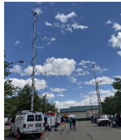
There was a lot of impressive equipment on display.