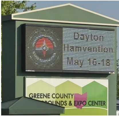
The venue is always welcoming!

Once again, an intrepid group of Hams ventured south (and west) to the wilds of Xenia, OH to attend the annual gathering. It was reported a total attendance of 36,814 (a new attendance record)! We must be crazy, but we still love it – as these pictures attest!