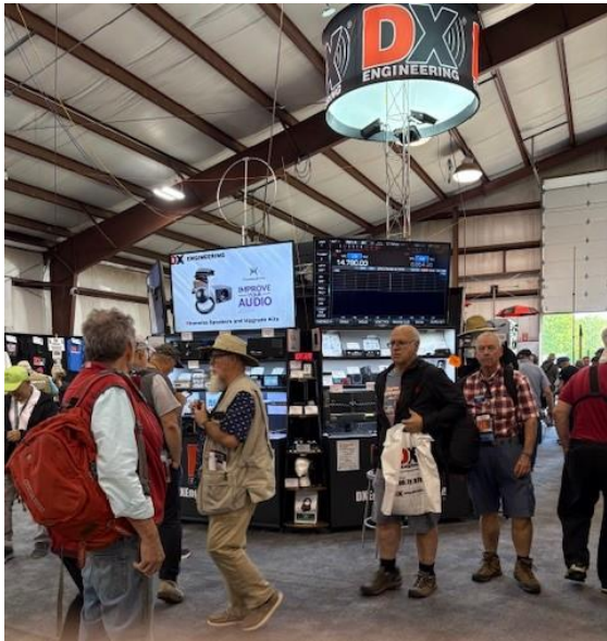
The vendors were well represented.