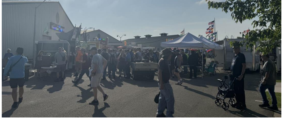
The crowd was large and enthusiastic!