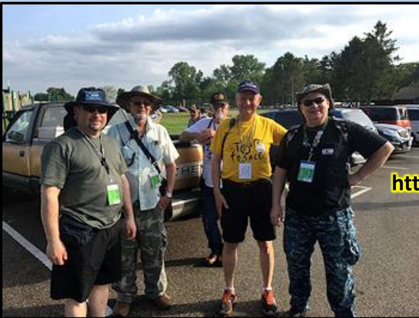
Hamvention May 2017 Greene County Fairgrounds Ohio

Just a heads up. Both the Grand Marais 147.195 and the Wetmore 145.410 repeaters were, and may be off the air for repairs. It sounds like it may be antenna and/or feedline problems for both. Hopefully they'll both be back on the air in the very near future.