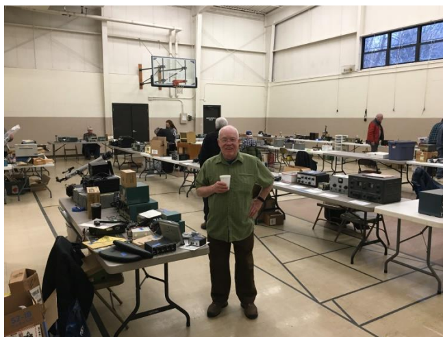
Fred mugging for the camera.