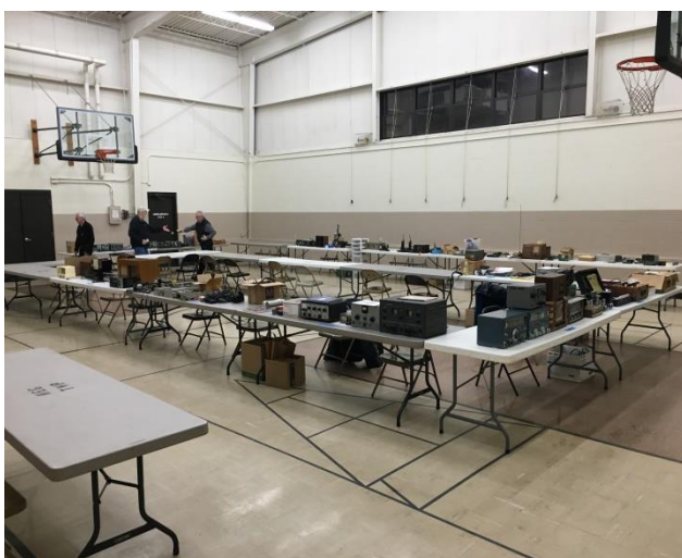
Pre-Swap set-up. All the tables were taken.