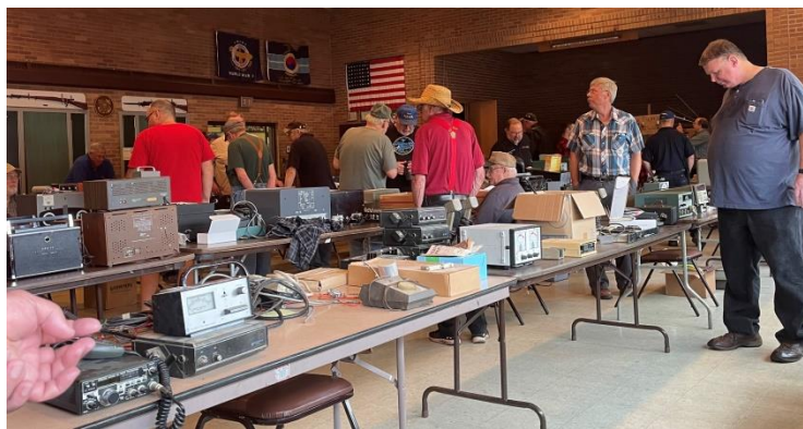
It was great to get out and meet people again!