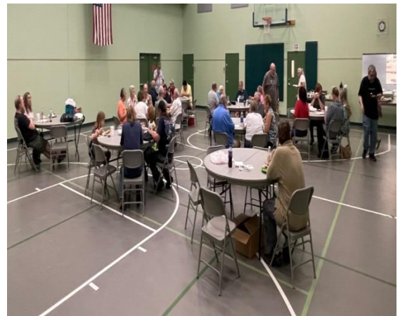
Good food shared by good friends!