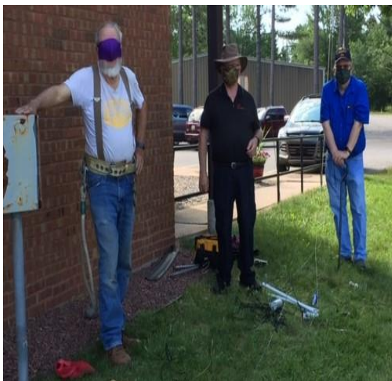
We all practiced appropriate social distancing – some more than others!