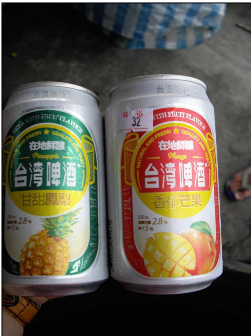
Oh no, my favorite Taiwan beer "New Taiwan Beer" has now become a fruit drink of your choice, pineapple or mango. Below are some of my friends from Taiwan operating from their club station.