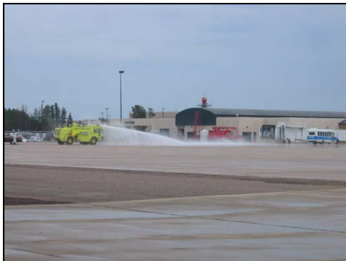
Dave KD8DRF at Sawyer Emergency Exercise June 2009 and fire truck laying down water for mock exercise.