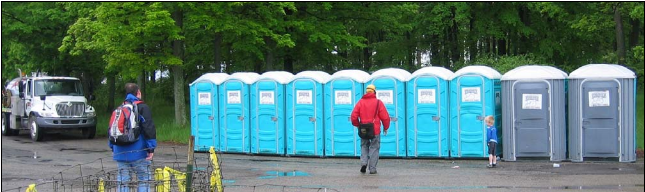
And here is one of the necessary stops while at the Dayton Hamvention.