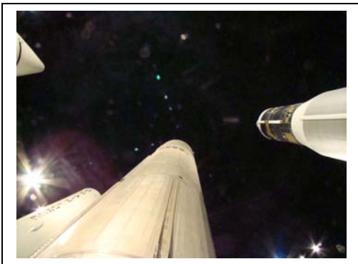
Here is an interesting photo from Dayton 2009. What in the world is it that you are looking at?