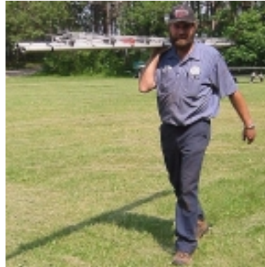
Setting up the antennas for Field Day

ARISS is an international project sponsored jointly by ARRL, NASA and AMSAT. A paper entitled "2001: an Amateur Radio Space Odyssey on the International Space Station," which details the development of ARISS and discusses the four new ARISS antennas, is available via the ARISS Web site << http://ariss.gsfc.nasa.gov/EVAs/amsat01.pdf >>.