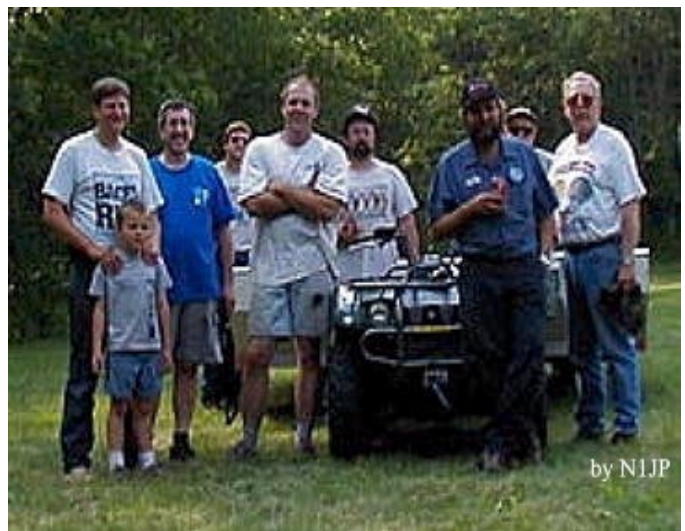
some of the Set-Up Crew