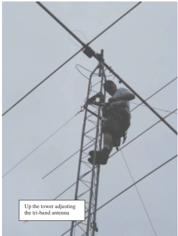
Up the tower adjusting the tri-band antenna