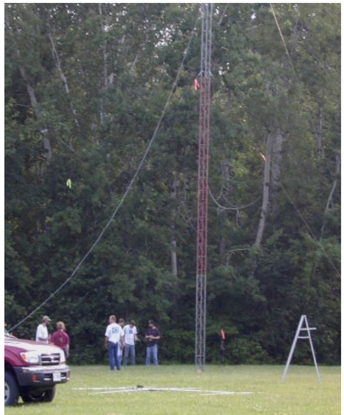
putting up the 2-element 40-meter beam