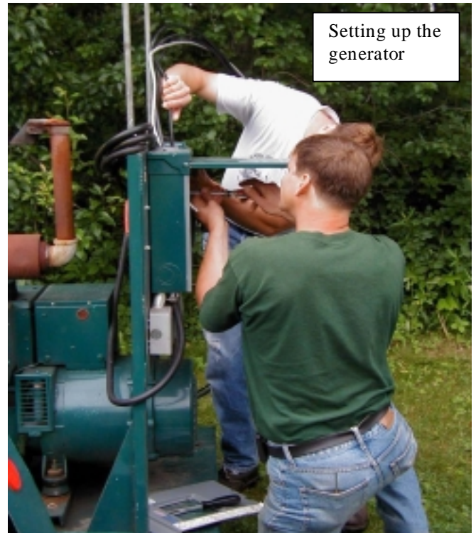
← the distribution box