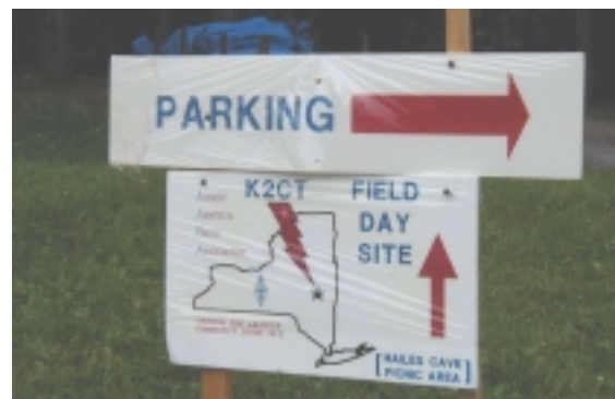
At Hailes Cave Thatcher Park, NY June 23-24, 2001

K2CT repeater Talk-in repeater 145.19 (-) MHz pl tone 100.0hz or 146.67 (-) MHz pl tone 127.3Hz linked to 444.30 (+) MHz pl tone 100.0Hz