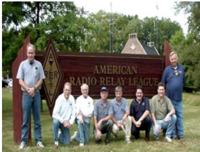
The group during a recent trip to Newington, CT W1AW