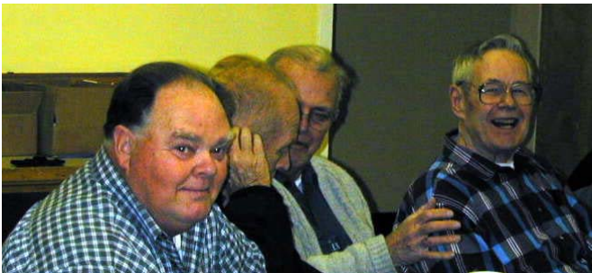
Dec. 2002 meeting