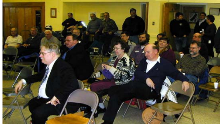
Jan 2003 meeting

Jan 15-16 ARRL Intern. DX Contest 22-23 CQ WW 160-meter SSB Contest North Carolina QSO Party