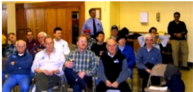
A t t h e J a n 2 0 0 2 M e e t i n g