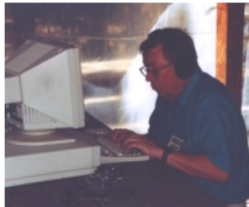
Field Day 2001