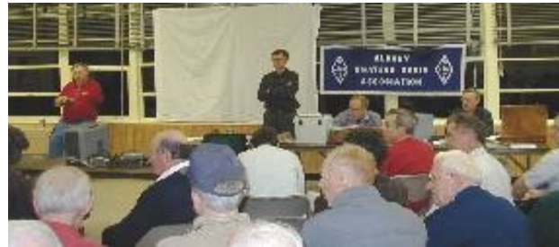
March 2002 Meeting