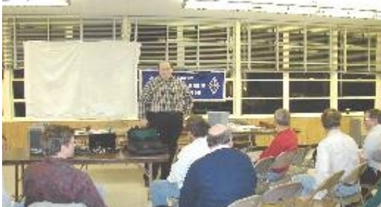
At the March meeting

The ARRL has adopted rule changes affecting Field Day, including the addition of a "Get On The Air" (GOTA) station, which replaces the Novice-Technician station.