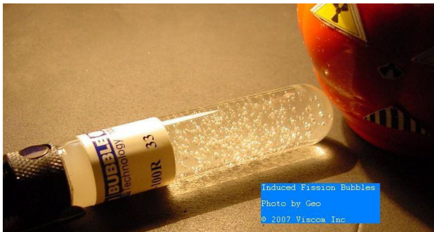
Fig.4 Bubbles captured from fast neutron exposure to the DU target while it was being bombarded with slow neutrons .

Only a bubble detector can be used in this scheme because of long count times, and the absolute zero false bubbles.