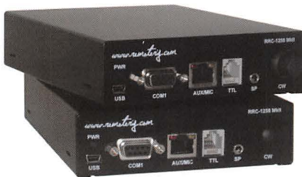
Fig. 4: Microbit supply generic interface boxes as well as products specifically tailored to Elecraft and to Yaesu equipment.

Those SDR transceivers that have the audio processing on board (the Flex Signature series being a good example) also lend themselves to remote control because there is relatively little data passing between the transceiver and the PC that is controlling it. Again, though, a strict interpretation of the Ofcom rules would require a separate channel for ultimate station control.