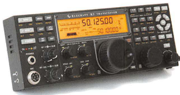
Fig. 3: The Elecraft K3/O-mini replicates the front panel of the K3 transceiver to allow remote control over the internet.

hundred miles is, fundamentally, of no consequence except, as mentioned earlier, for the issues arising from network latency. Elecraft have taken a different approach with the K3 transceiver, which is to offer the K3/O, Fig. 3, which integrates with a remote control solution from RemoteRig. This is, in effect, the front panel of a K3 that can be used remotely to operate a full K3 at a remote location. The Elecraft remote approach currently has far lower latency than some of the solutions from other vendors and is therefore proving very popular.