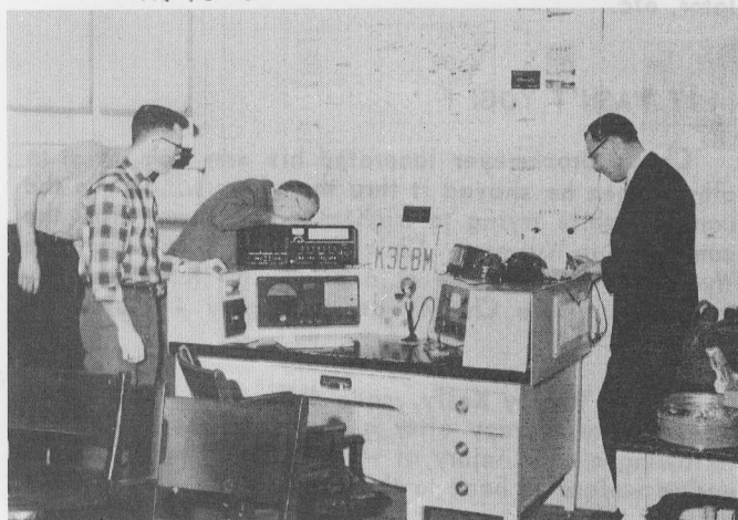
K3CBM, ARMS HDQTRS CLUB STATION