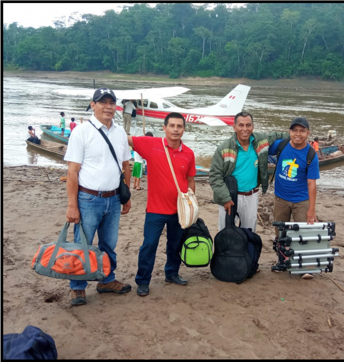
Missionary Outreach Team