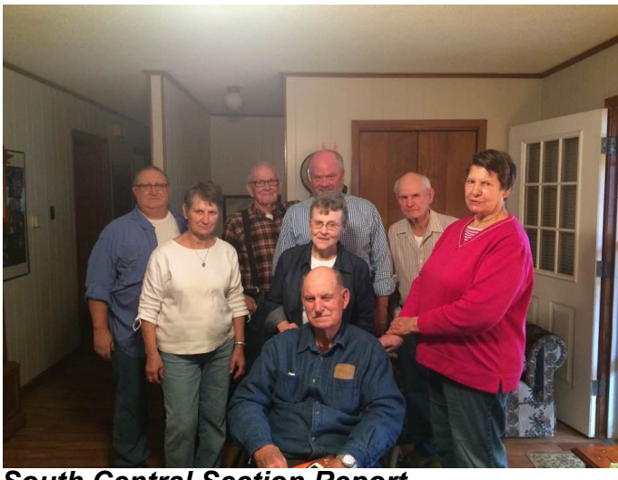
South Central Section Report