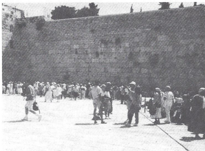
THE WAILING WALL