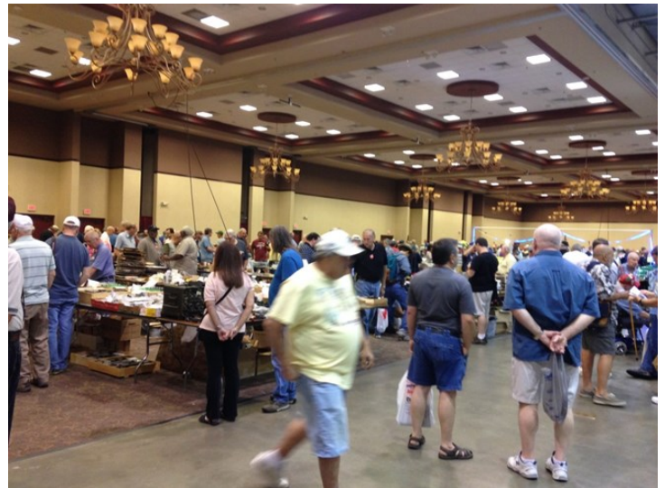
Inside view of the Huntsville, Ala. Ham fest 2015