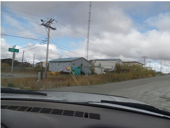
KYKD in Bethel, Alaska

The picture below is a rainy foggy [normal] day in Bethel. The streets are just sand as gravel is located about 100 miles up river and has to be brought down by barge.