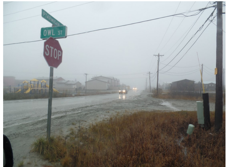
Foggy rainy sand covered street in Bethel ,Alaska