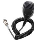
HM-219 Hand microphone with UP/DOWN switches (Same as supplied)