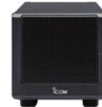
SP-38 High quality audio and matching height Maximum input: 7 W