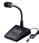
SM-50 Dynamic desktop microphone including [UP/DOWN] switches and a low cut function