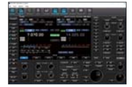
RS-BA1 (Version 2) IP remote control software