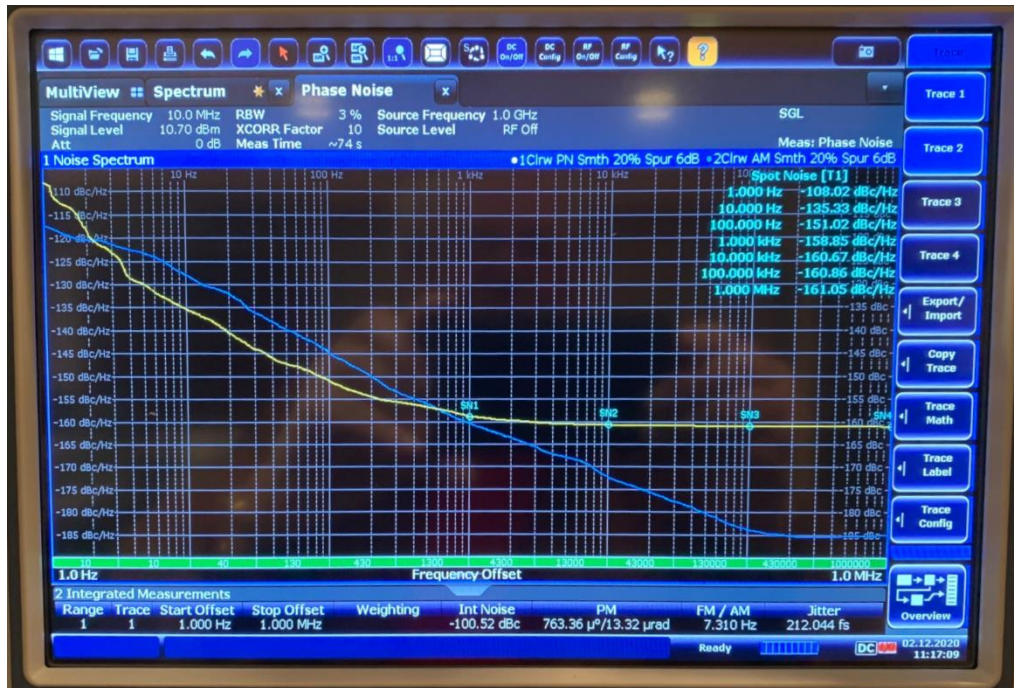
Figure 2. FSWP AM Noise Chart (taken on R&S FSWP Signal Analyzer).