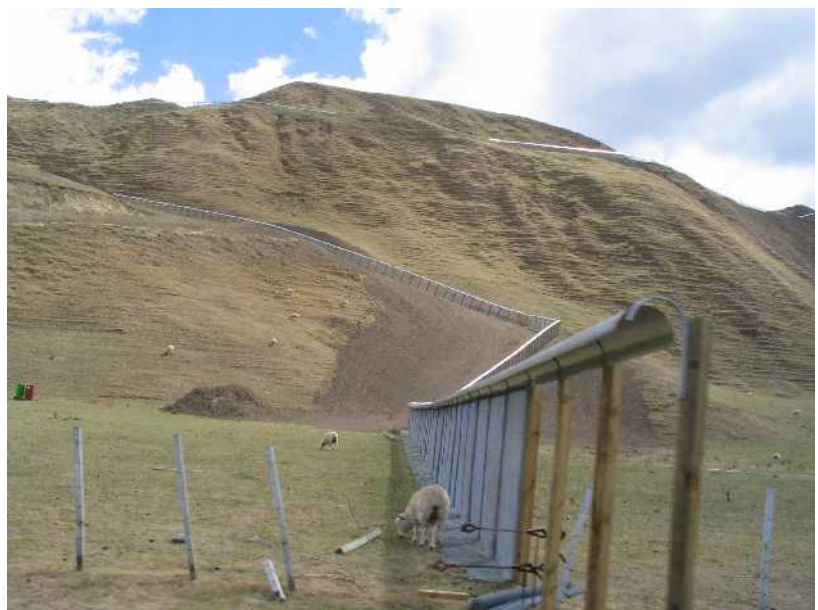
"The Great Wall of China"

The owner of Cape Kidnappers is the chief financier but I think DOC is involved as well. Since we were there, there has been an item on television showing that in some areas people are removing parts of the fence, probably to protect marijuana crops, and this is increasing the price considerably.