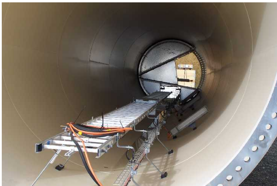
Inside view of a Wind Generator.

for visitors in cars a great tourist attraction with a sweeping view of the Manawatu district. The Wind farms certainly stand out on the hills as you approach Palmerston North city.