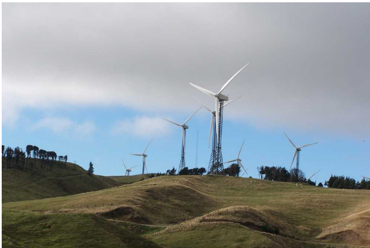
Windfarm generators on hills above Palmerston North

On Monday after the NZART Conference, Geoff and I were lucky to be included in a small group ( including Maureen ZL4AN and several OMs ) to go on a 4wheel vehicle drive to see the local wind generators.