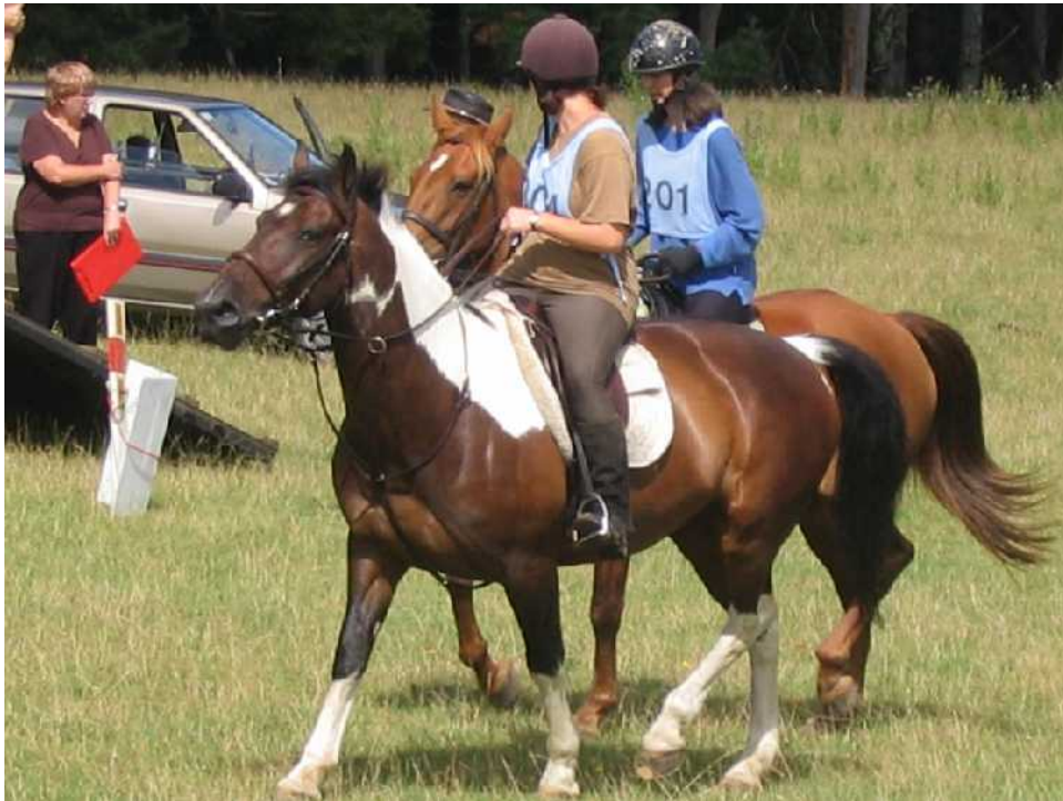
Contestants on their horses during the enduro

The need for AREC services in our area has been minimal. We do not have extensive areas of bush for people to get lost in, and natural disasters are few and far between as our volcanoes are reputedly dormant, flooding on the Waikato is able to be controlled by the system of dams and wetland upstream. We are much less liable to earthquake than those on the Whakatane-Wellington line. Incidents on the Waikato River and the harbour and coast are handled by coast guard.