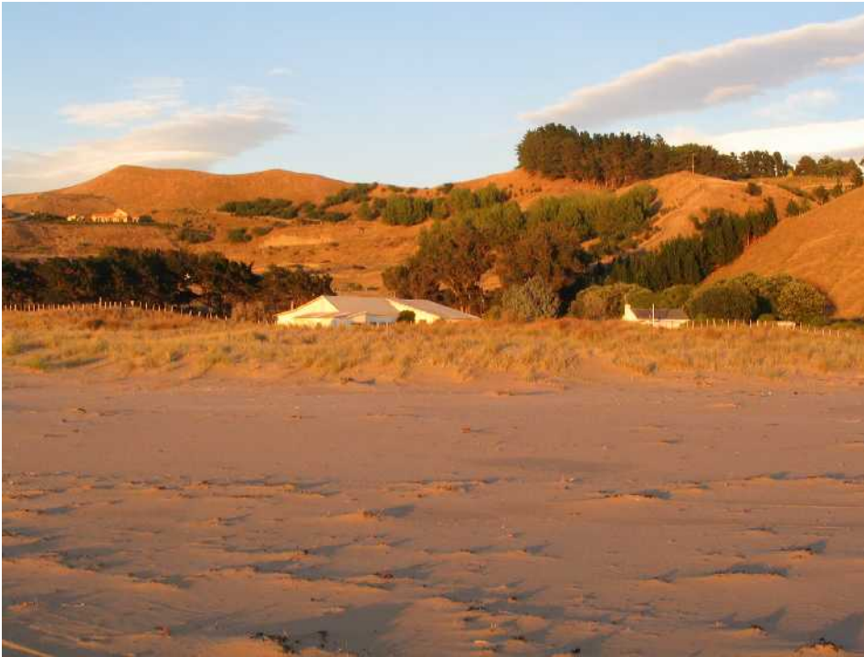
Beautiful Ocean Beach

The Ocean Beach area was of interest because last year there was an item on television drawing attention to the plan to open up the area for several hundred houses! A group has been set up to fight this.