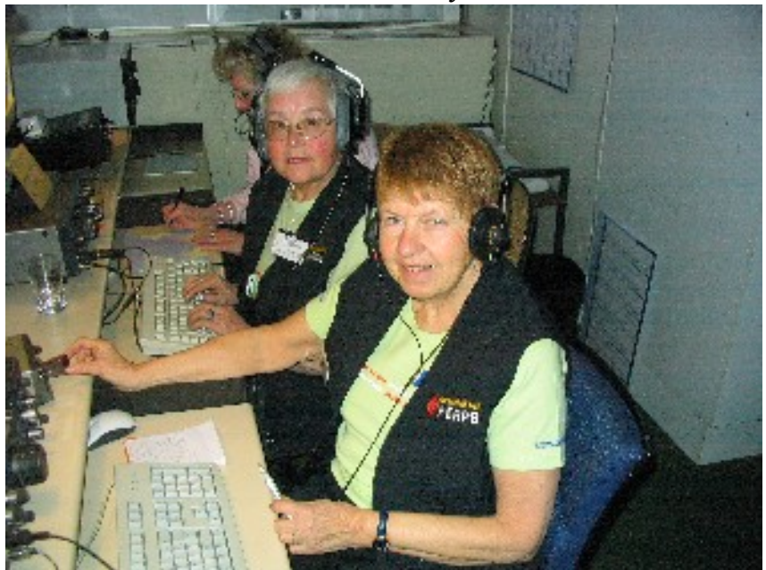
The team of 3 YL's on the air

Over 600 QSO's came in the log, the QSL manager is F5LGF.