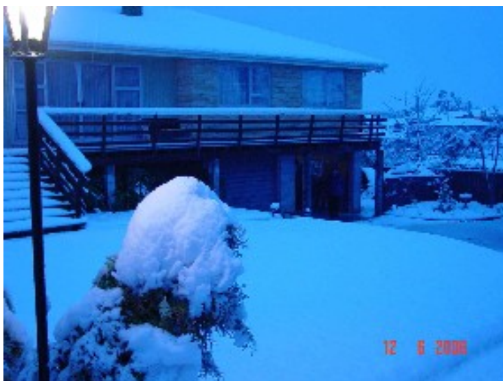
Sharron ZL3AE home covered in snow

There were curling competitions being held on the frozen lakes for the first time in many years. The Civil defence were kept really busy helping out people who were isolated without power, phone and transport because of the roads being closed.