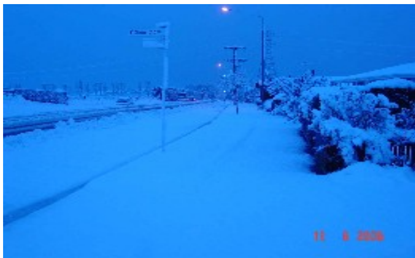
Pages road Timaru where Sharron lives

Sharron ZL3AE sent the following photos of her street and home on 12 th June 2006 when the South Island was blanketed by the heaviest snowfall for 48 years. Many residents of the South Island were without power and telephones for around three weeks. Roads were impassable and schools were closed.