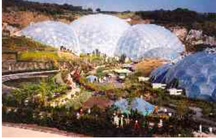
The Eden Project

The Eden Project was created out of a huge clay pit. It is run by a Charitable Trust that gains a 29p