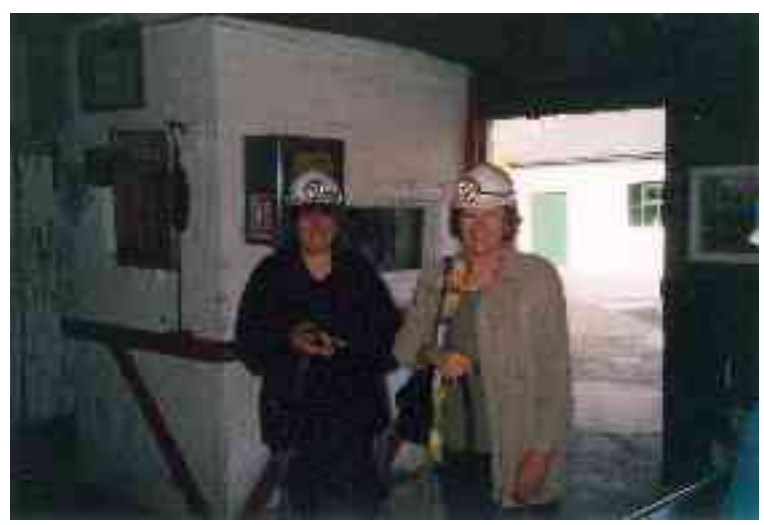
Geared Up for BigPit

Not related to the Eden Project, is the Eden Camp near York. Eden Camp was a prisoner of war camp for the Italians and Germans. It still retains its compound. We went there with my nephew and spent the day walking in and out of 28 nissan huts each with different themes covering from the aftermath of World War 1, to the follow up to World War II and beyond. Some had exhibits of landgirls and women at war. I personally liked the theme of the Rat Catchers - girls from all walks of life including hairdressers and one professional dancer from Jamaica. In some parts of the country land girls formed themselves into anti-vermin squads. Four girls in North Wales travelled around by bicycle and killed 7,689 rats, as well as 35,545 rabbits, 1,668 foxes and 1,901 moles in fourteen months.