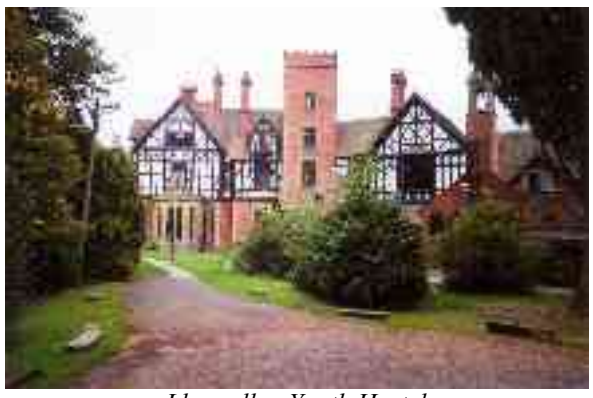
Llangollen Youth Hostel

Visitor Centres provide accommodation leaflets and bookings. But if you wanted to park just to pick up a pamphlet, carpark meters are there to be used. No free parks. Signs to Visitor Centres could be improved. Small brown ones not always evident led into a maze of one-way streets and in some cases we never found what we were looking for. We took a cellphone with us which proved to be very useful. The Sim Card was changed for an UK one and a new telephone number issued. This meant we only had to pay UK phone charges. We had learnt our lesson the hard way in Italy when a rental phone from Telecom meant all calls had to go via Australia to reach New Zealand or the UK, even when you were talking to someone in the UK.