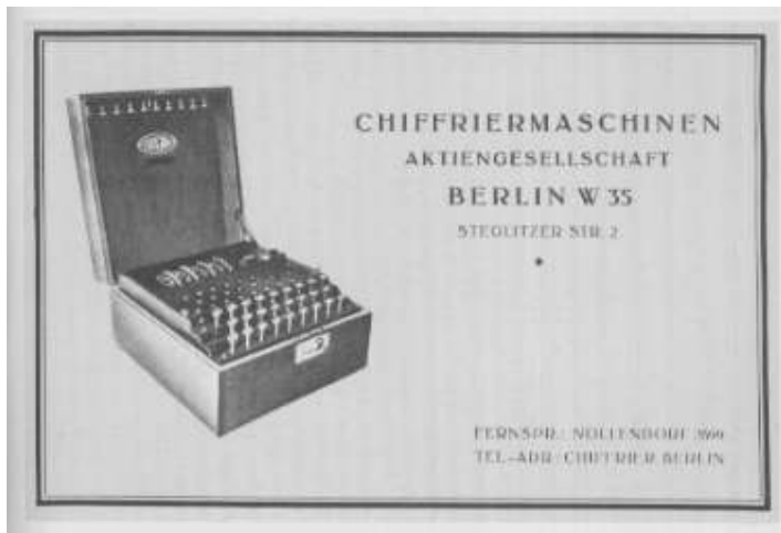
An Enigma Machine

More details at the next meeting on the 14 th May.