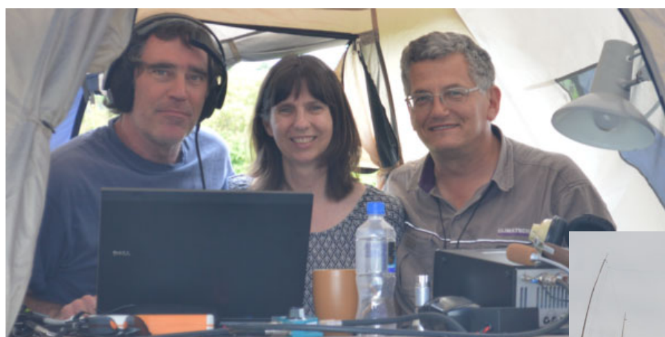
ZL3TE CAROLYN ZL1JJN