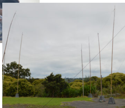
Poles for the 40M loop