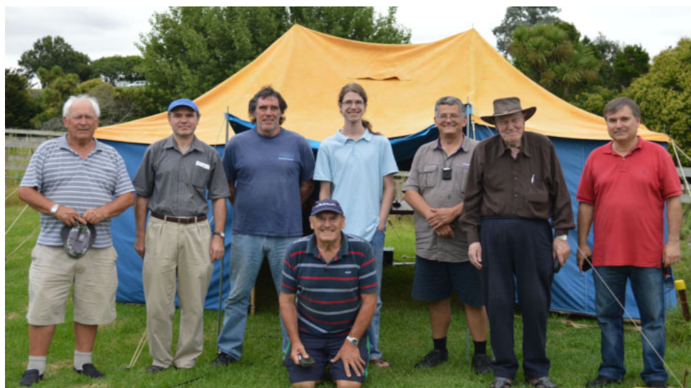
ZL1AAR ZL1TM ZL3TE ZL1LMN ZL1JJN ZL1AJR ZL1AAW ZL1WAL