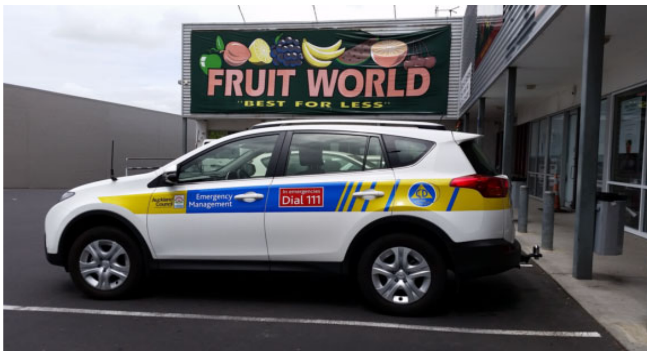
Spotted in Grey Lynn - Civil Defence Keeping Auckland Safe from the Queensland Fruit Fly invasion

Meting closed at 2100 hours with supper served by Ray ZL1AJR