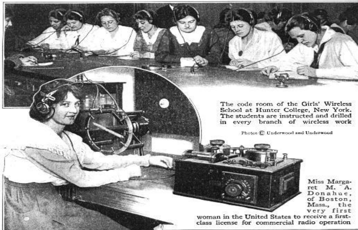
The code room of the Girls' Wireless School at Hunter College, New York. The students are instructed and drilled in every branch of wireless work