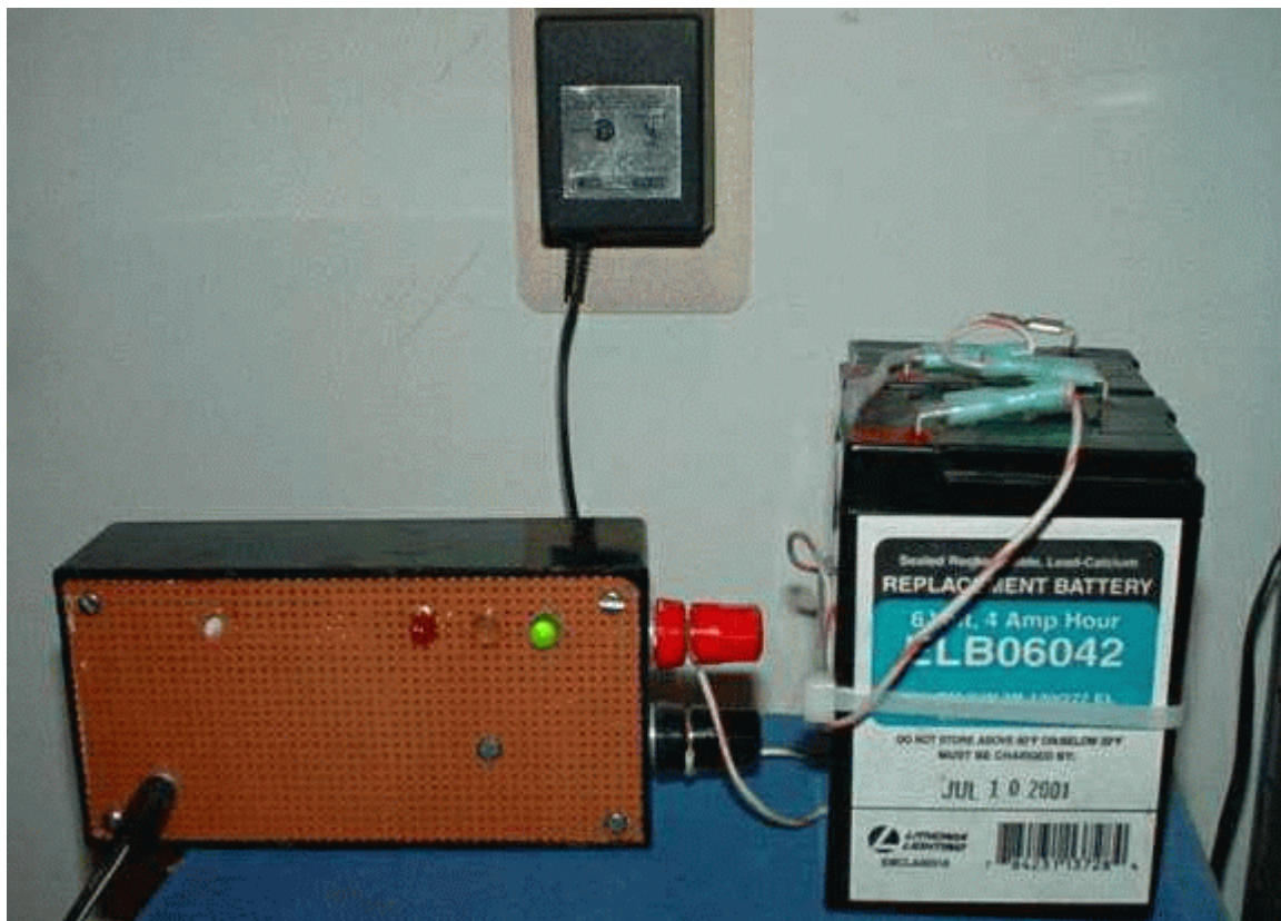
Figure1: In Use: Green LED=Float Mode