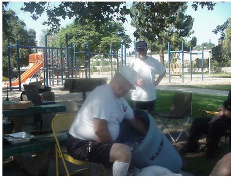
“Dag nab it, I know it’s in there somewhere!!”