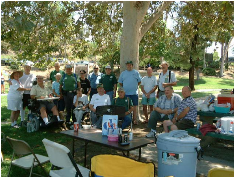
The Picnic Group 2003