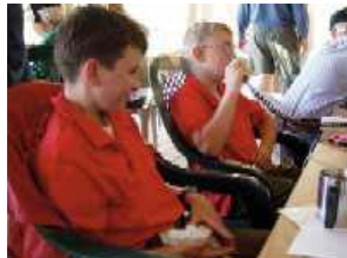
Pictures from last year's activities