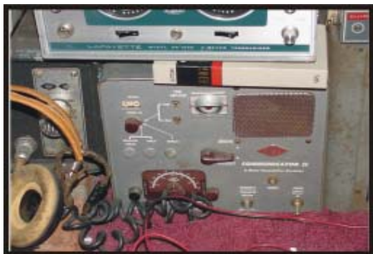
Ad from the past