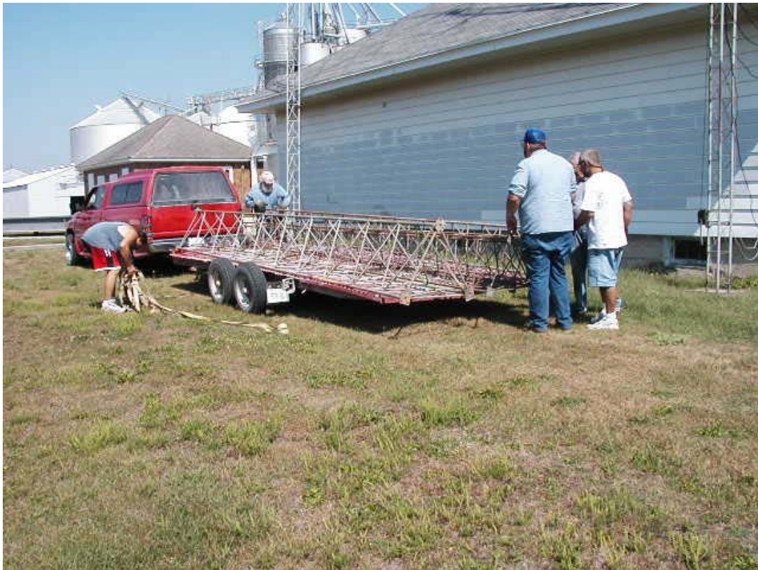
Tower Arrives At Its New Home