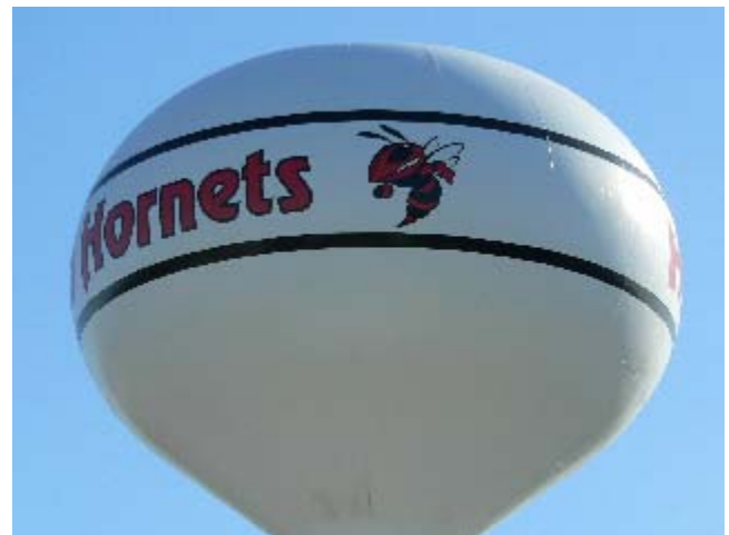
N40° 18.807' W88° 58.623'