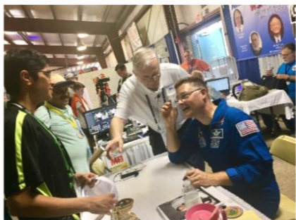
Some shots from the 2018 Hamvention

Sunday 8:30 P.M. 146.730 123.0 PL Open Net