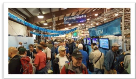
Some shots from the 2017 Hamvention

Sunday 8:30 P.M. 146.730 123.0 PL Open Net