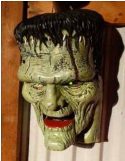
This may have been one of last year's attendees.