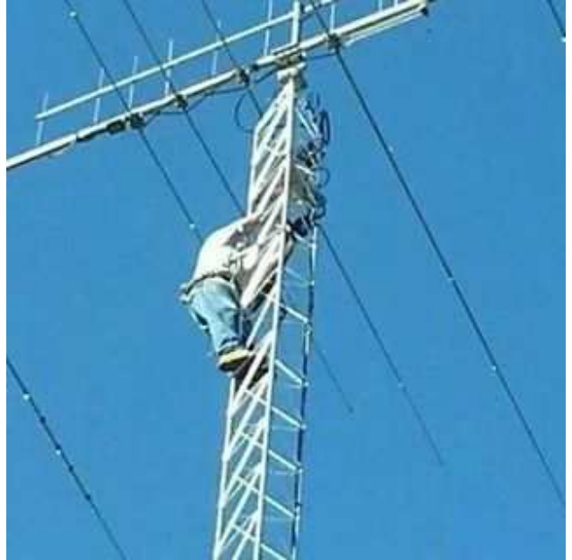
WA8MCD New Antenna