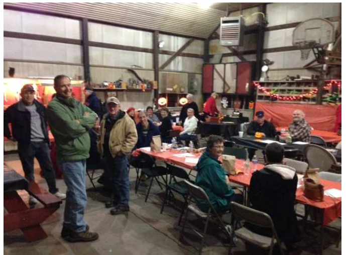
The great Party at KC9PIM's Farm