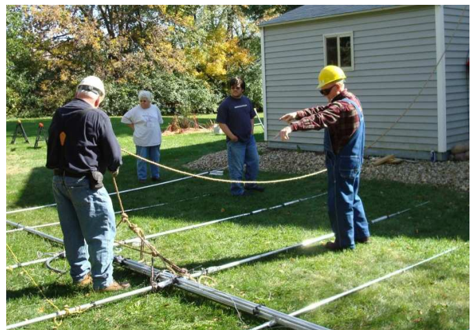
AB9M ant going up KJ9P-AB9M and family