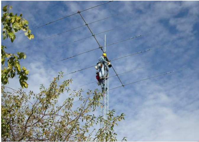
AB9M's Antenna AA9LC and AC9S on tower.