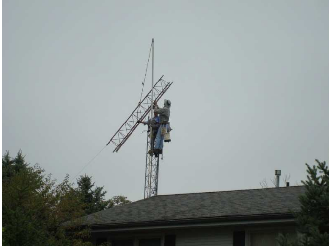
AB9M old tower coming down Workers AC9S-AA9LC