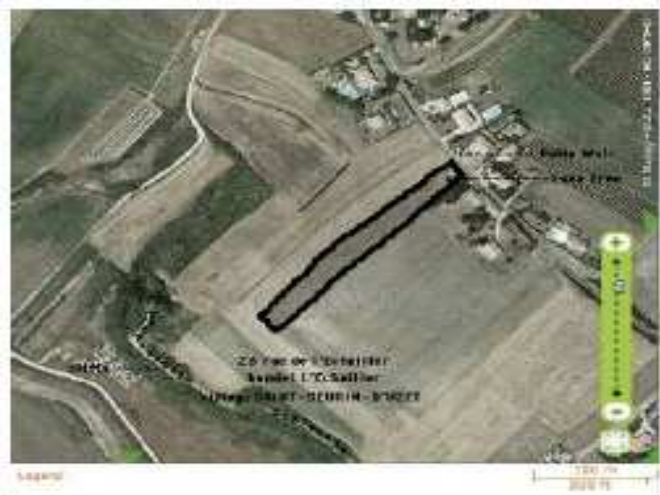
Birds Eye Showing Front Yard