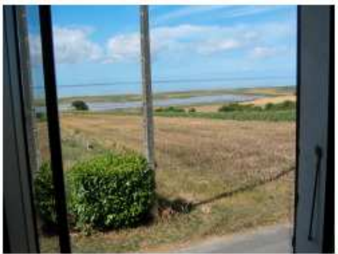
View From Front Room