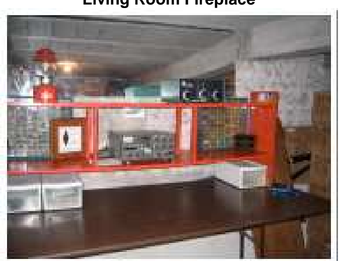
The Shack Is Started