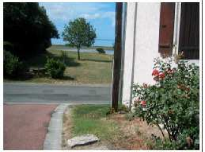
View of Water From Front Door