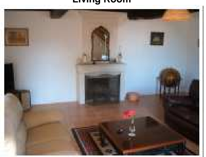
Living Room Fireplace