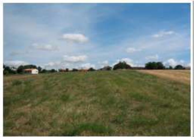
View From End of Front Yard