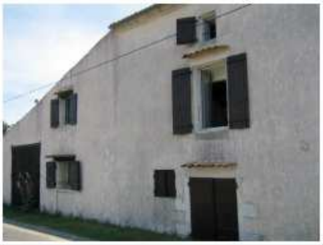
Outside Water Side