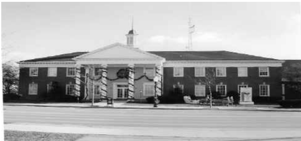
PLYMOUTH CITY HALL

Club meetings are held on the third Tuesday of every month at 7:30 PM local time except July and August.