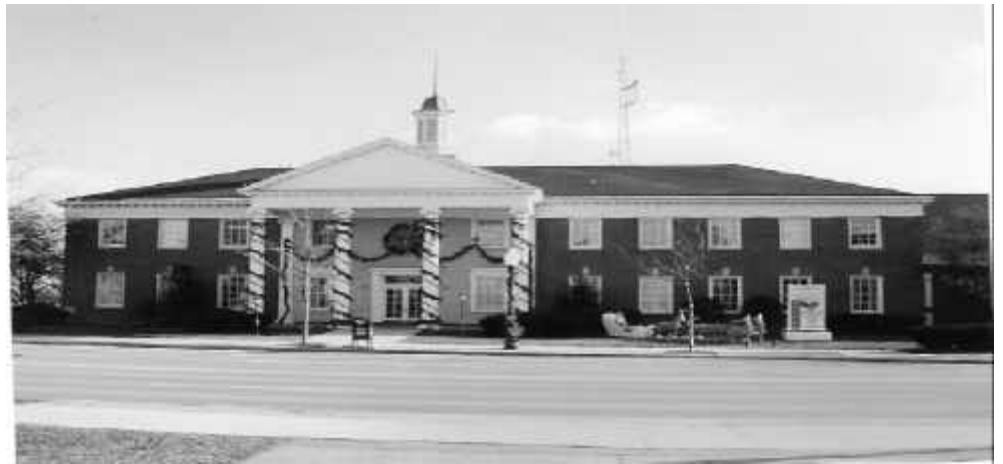
PLYMOUTH CITY HALL

Club meetings are held on the third Tuesday of every month at 7:30 PM local time except July and August.