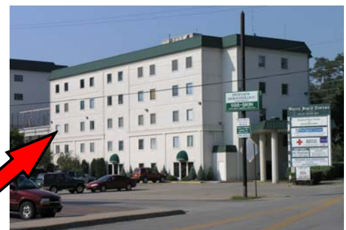
MWA meeting location White Birch Tower Building 1299 Pineview Drive Morgantown WV Red Cross area on 3 rd floor

This is the same location as the MWA meeting, but is NOT on a regular scheduled meeting night