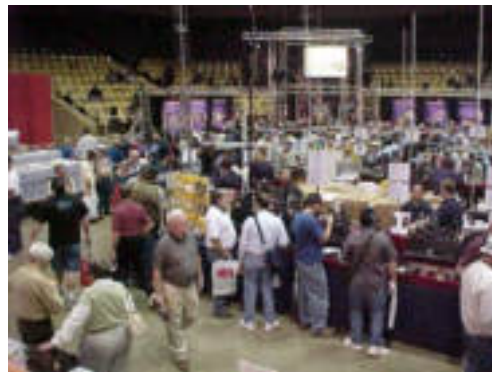
MFJ (foreground) Icom behind