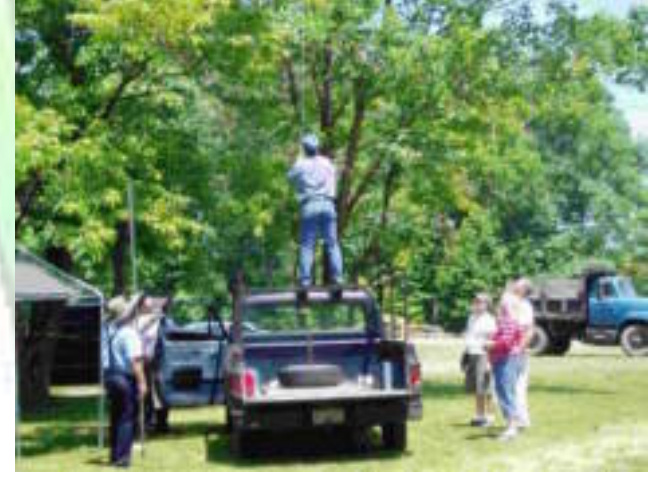
TV and PSK31 going on 20M making QSOs and we made some QSOs on 6 meters. It is 4 inches of rain in VA. 3 inches of rain since 11AM in Pendelton County, WV. South Branch of the Potomoc River is up a foot and rising. More rain coming expected to be heavier through the night. That's the advantage of Field Day, operate from a hilltop. The Dominion Post reporter wrote up a real nice article that appeared in Sunday's paper. We're on record at the ARRL for our good efforts, watch for our listing

to ask what Ham radio operators do to help out with the hurricane. One of the guests gives a really good plug for ham radio, saying their help is very important and valuable. One guest comments, "I know they practice for this type of thing all the time." I guess Field Day was worth it. We got a message out to report our Field Day participation to the SCM and a couple other NTS messages for extra points. We operated in a public place: Camp Mountaineer. There were 5 stations set up, even if 10M never opened for QSO's. We tried APRS but the TNC wouldn't cooperate. Lots of 40M phone QSO's, we're talking fast! I like CW so, I keep plugging away until the last QSO just before noon. I manage to work some old friends on 15M CW, it's always a thrill to say hello to old friends and familiar calls. I have missed very few Field Days since my first one back about '66. It's always a lot of work but the fun part of it gets better every year. Augusta county, VA reporting inches (did I hear that right, maybe it is 4 inches) of rain at 10:30 pm. Logan county WVA reporting lots of steady rain but no wind. My first Field Day, I operated with "K 3 Hairy Ugly Octopus". "Whiskey 8 Mike Whiskey Alpha" is a lot easier. Well, It was a very good Field Day this year, we even had slow scan