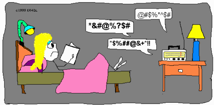
DURING A LATE-NITE STUDY SESSION FOR HER AMATEUR LICENSE, BUFFY LISTENS ON 75 METERS TO PICK UP SOME HAM LINGO.